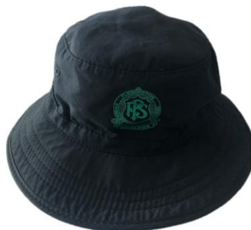
Wide Brim Hat